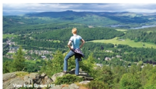
View from Birnam Hill